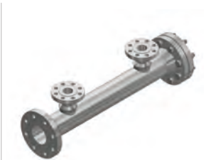
Stilling Well & Level Chambers