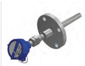
Hazardous Location Temperature Sensors