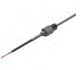
Custom Temperature Sensors