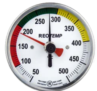
Min-Max Pointer with Color Bands